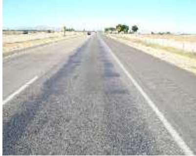
a. Test Sect. 7, NB RTE 86 ISS RAB Binder(PG 79-22 actual)