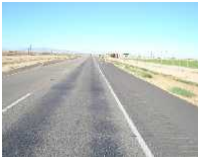
b. Test Section 2 NB 86 AR 4000