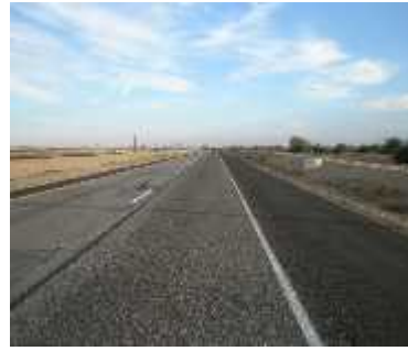
d. Test Section 10, SB RTE 86 ISS RAB binder (PG 86-16 actual)