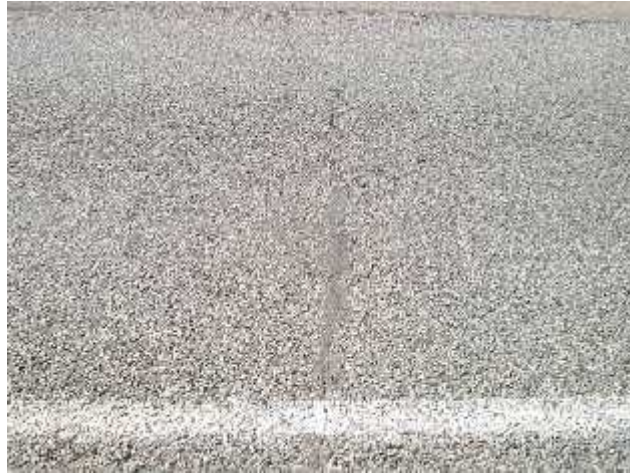
Figure 4. Test section 9 PMAR with some reflective cracking

Test section 9 did not mitigate reflection cracking as well as the asphalt rubber test sections 1 through 6, which is illustrated in Figure 4. However, when placed over sound pavement, the reflective crack mitigation was equal to or better than the modified binders (Paramount TB and the ISS RAB). This is primarily due to the higher application rate of the binder and the higher percentage of CRM which increased the viscosity of the binder and higher elastic properties of the PMAR binder.