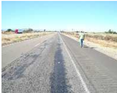
b. Test Sect. 8, NB RTE 86 Paramount Petroleum TB (PG73-22 actual)