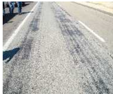
f. Test Section 12 SB RTE 86 Paramount Petroleum TB (PG 73-22 actual) with 9.5 mm (3/8 inch) gradation