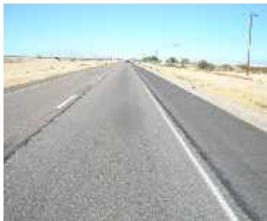
c. Test Sect. 9, NB RTE 86 ISS PMAR using 16% CRM and 2% SBS polymer