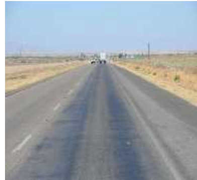
d. Test Section 4 NB 86 PG 70-10