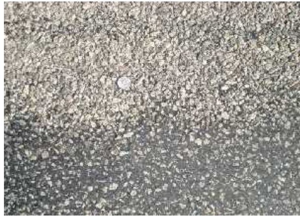
Figure 7. Test section 12, Close-up of PG 73-22 with 9.5 mm (3/8 inch) aggregate

Figure 7 shows the condition of the only test section that used 9.5 mm (3/8 inch) chip aggregate. This test section had the most bleeding, but not as much aggregate loss as test section 11. It is clear the 9.5 mm (3/8 inch) aggregate is not appropriate for chip seals in these types of conditions. This aggregate size has been used successfully in other parts of the state with more moderate temperatures and traffic conditions. The aggregate loss on the edge is due to not knifing the edge and a plugged tip.