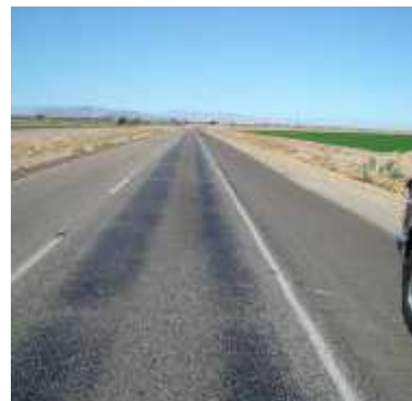
f. Test Section 6 NB 86 PG 70-10