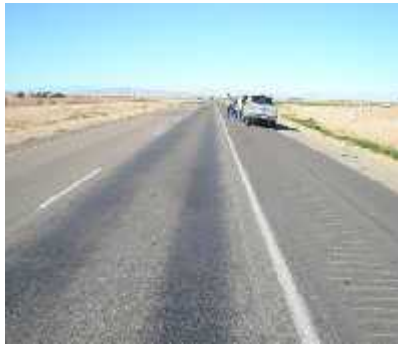
a. Test Section 1 NB 86 AR 4000