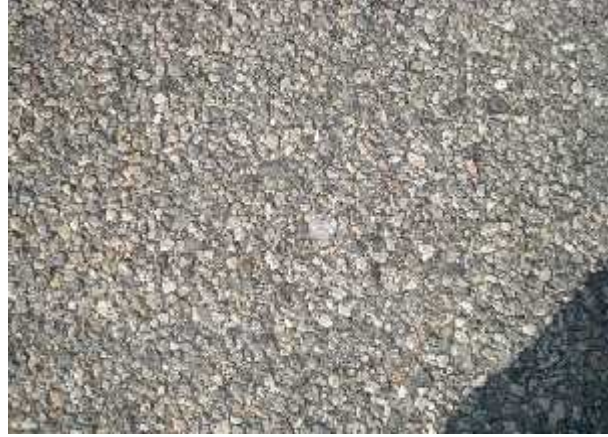
Figure 5. Test Section 10, RAB binder PG 86-16 (actual)

Test sections 11 and 12 were both the modified binders prepared by Paramount Petroleum at the terminal. The binder was prepared to meet a grade of PG 70-22, and the actual grade was (PG 73-22 actual). Test section 11 contained the 12.5 mm (½ inch) pre-coated aggregate while Test Section 12 contained the 9.5 mm (3/8 inch) pre-coated aggregate. As can be seen in Figure 6 there was aggregate loss that occurred shortly after construction for 4 to 6 weeks. The aggregate loss on the edge is due to not knifing the edge and a plugged tip.