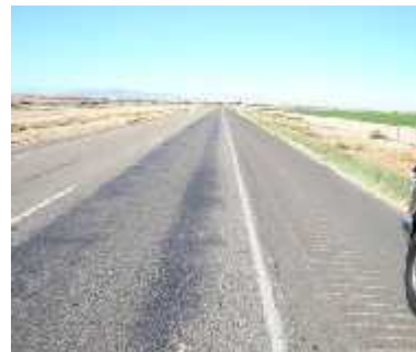
e. Test Section 5 NB 86 PG 70-10 w/o asphalt modifier