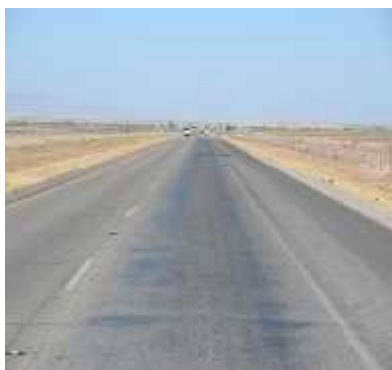
c. Test Section 3 NB 86 PG 70-10