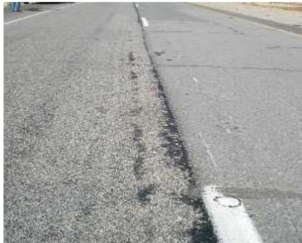
Figure 6. Test Section 11 showing aggregate loss

Test sections 11 and 12 were both the modified binders prepared by Paramount Petroleum at the terminal. The binder was prepared to meet a grade of PG 70-22, and the actual grade was (PG 73-22 actual). Test section 11 contained the 12.5 mm (½ inch) pre-coated aggregate while Test Section 12 contained the 9.5 mm (3/8 inch) pre-coated aggregate. As can be seen in Figure 6 there was aggregate loss that occurred shortly after construction for 4 to 6 weeks. The aggregate loss on the edge is due to not knifing the edge and a plugged tip.