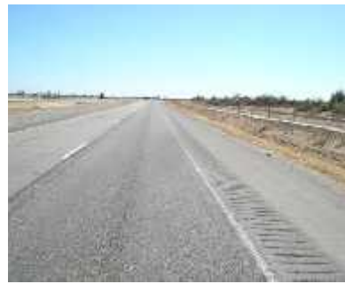
e. Test Sect. 11, SB RTE 86 Paramount Petroleum TB (PG 73-22 actual)